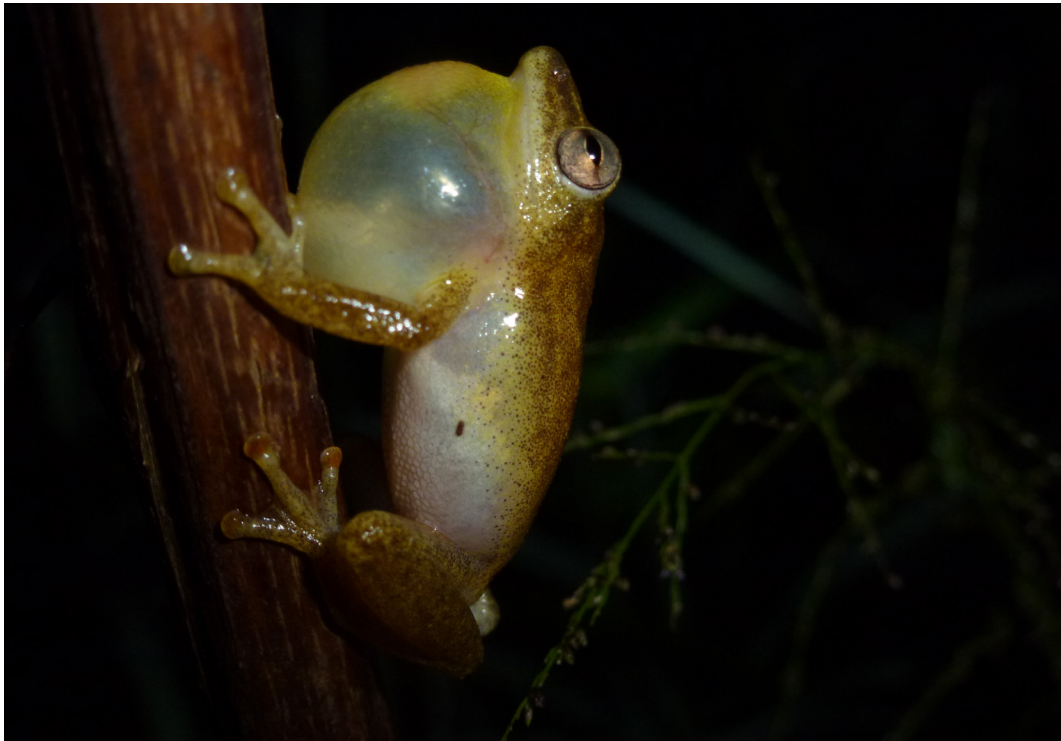
Fig. 4. A calling Hyperolius concolor concolor male recorded at the garden of the Theological and Pastoral Institute of Daloa.