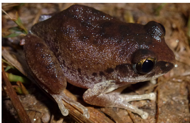
Fig. 7. Dorsolateral view of Leptopelis viridis , one of the most widespread anurans from the Daloa urban area.

urban areas, the availability of a diverse set of habitats is a prerequisite for the maintenance of high amphibian species richness.