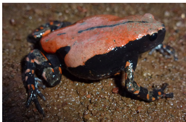
Fig. 8. Dorsolateral view of a male Phrynomantis microps from Daloa urban area.