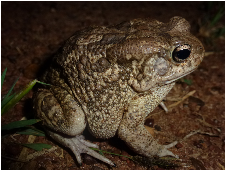
Fig. 2. Amietophrynus regularis female recorded in the garden of the Theological and Pastoral Institute of Daloa.

ban sites of Daloa (Table 1); it was particularly abundant among grasses near ponds. In the rainy season we recorded some, presumably migrating, individuals on windows, balconies, and in houses.