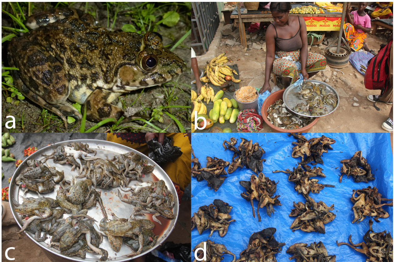
Fig. 3. Hoplobatrachus occipitalis from the district of Daloa (a) and a woman trading this species on a local market (b); batches of five adult specimens, fresh (b and c) or dried (d), were sold for 500.00 FCFA (app. 0.84 USD).

With its geographic position in a transition zone between the semi-deciduous forest and humid savannah, we expected the urban landscape of Daloa region to promote a diverse amphibian fauna. However, the overall species richness (30 spp.) was lower compared to the species richness recorded in western, central, and northern Ivorian savannah areas, for instance the Mont Sangbé National Park (45 species, Rödel 2003), Lamto Faunal Reserve (40 species, Adeba et al. 2010), Marahoué and Mont Péko National Parks (33 species for each park, Rödel and Ernst 2003), or the Comoé National Park (33