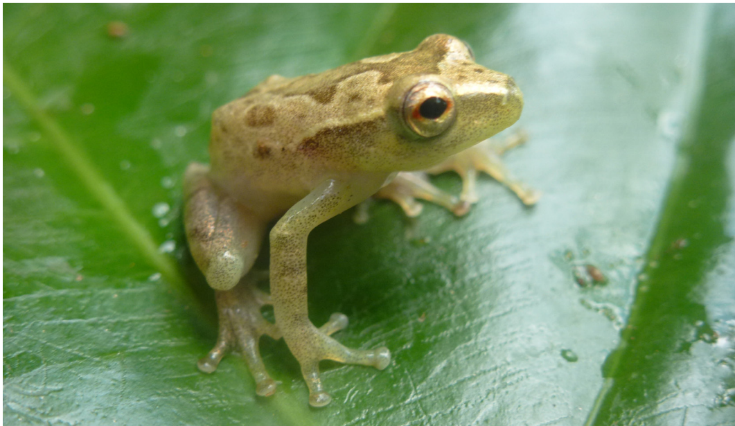
Fig. 5. Dorsolateral view of a juvenile Hyperolius sp. with uncertain taxonomic status from the urban Daloa.

species, Rödel and Spieler 2000). Compared to these and other West African savannah areas with known amphibian assemblages such as north-western Benin (Nago et al. 2006), east-central Guinea (Greenbaum and Carr 2005), central-northern Guinea (Hillers et al. 2008a), or eastern Ghana (Leaché et al. 2006), the urban landscape of Daloa ranks among the West African areas of medium to low amphibian species richness. While we recorded few forest related species e.g., Amnirana albolabris , Leptopelis spiritusnoctis , Phrynobatrachus calcaratus , and P. gut-